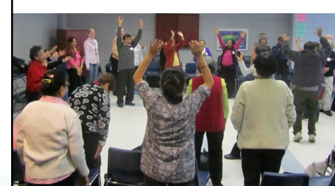
Seniors get active at Queen Victoria Public School.